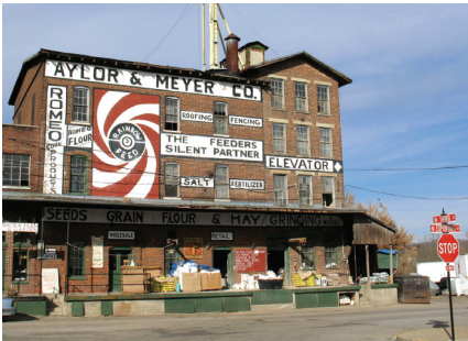
As these photos illustrate, rural can mean many different things. Rural communities, whether they are small towns and cities, working lands, or tourist-based economies, are characterized by an interaction between land and place. Smart growth strategies can be used to maintain the defining characteristics of rural communities as they grow and change.

The land-based economy and its accompanying way of life in rural communities have been affected by a number of outside forces. While many of these changes have been gradual, others have been more immediate. As these communities continue to change, rural identities may be altered and communities may lose the opportunity to set their own agendas. By understanding the challenges that their communities are facing and thinking strategically about future growth and development, rural decision-makers can direct growth in a way that benefits the community while preserving its rural heritage and traditions.