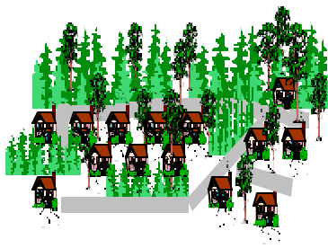
Developed uses form intermittent breaks in the forests of the suburban fringe

Suburban Fringe —typified by pockets of recent development interspersed throughout extensive stands of intact forest land. Woodlands remain the dominant landcover, but the infusion of development signals increased pressure on tree resources. Seen from above, developed areas exist as intermittent holes in the fabric of an otherwise dense forest canopy. Forests in such locales operate close to their optimal levels in absorbing pollutants, storing and metering runoff, and providing habitat for forest-dwelling species. In Rhode Island, the northern and western portion of South County, the western portions of Kent and Providence Counties, and the eastern-most portion of Newport County appear to fit the suburban fringe forest profile.