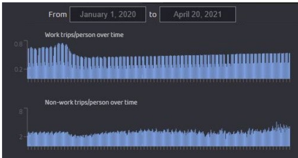
Work and non-work trips per person from 1/1/2020 to 4/20/2021

As it pertains to traffic patterns from April 2021 when this tool was last updated up until Spring of 2022, we can utilize the congestion scan tool to show changes in congestion for select roadways over select time frames. For the purpose of this report, two time periods were compared (May 8, 2020 to May 6, 2021 and May 7, 2021 to May 6, 2022) along two roadways (I-95 North and Southbound and RI-146 North and Southbound) using NPMRDS personal vehicle and truck data and showing Congestion percentage compared to free flow speeds. This analysis was performed to give an idea of the changes observed along two one-year periods regarding roadway use since the COVID-19 impact tool was last updated.