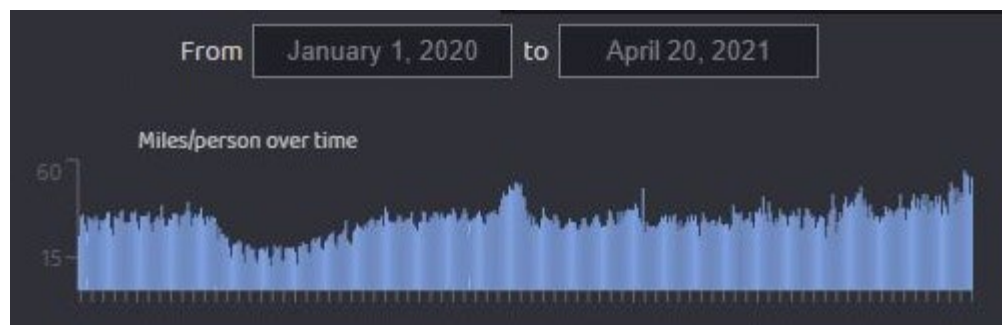
Miles per person from 1/1/2020 to 4/20/2021

Prior to the pandemic, the percentage of people staying home on weekdays was around 17%. This number spiked to around 35% in April 2020, which resulted in a substantial shift in cars on the road. Similarly, trips per person decreased from 3.5 trips per day to around 2.5 trips per day in April 2020. That number moved back to a normal range by July of 2020, however, and as of April 2021, had increased to over 4.0 trips per day. A similar trend can be seen in miles/person per day in Rhode Island, as dictated in the graphic below. These trends caused more irregular congestion on roadways, and while peak hour traffic still exists in 2021, it had become less predictable throughout off-peak hours.