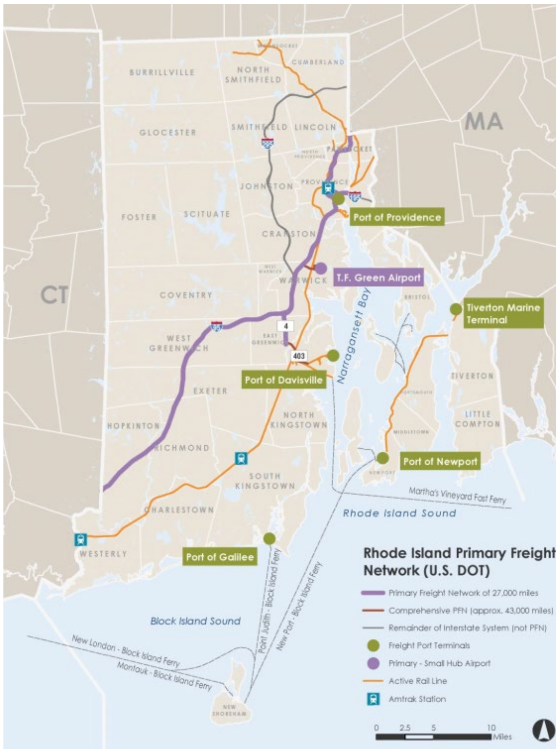
Figure 1: US DOT Rhode Island Primary Highway Freight System Map