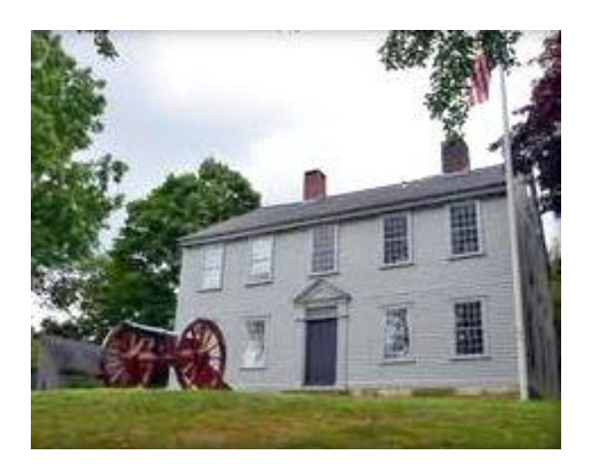
PHOTO TRIVIA: Do you know where in RI this building is located? See the answer at the bottom of the newsletter.

October 18 at 2PM USDA-NRC Offices 60 Quaker Lane, Warwick