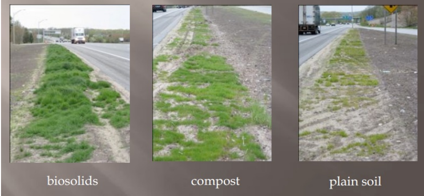
Inclusion of Bio solids on Roadside Turf, I-295, (R. Brown, URI, 2011)