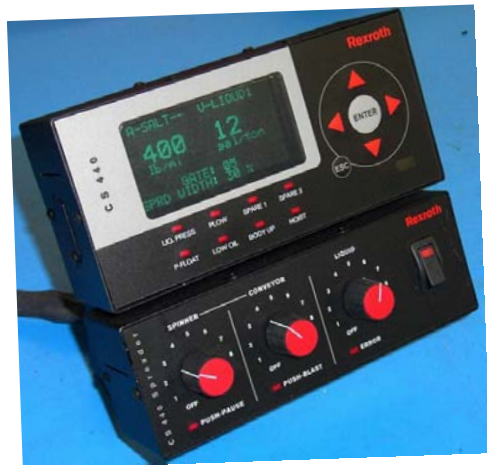
Closed-loop Snowplow Control Module used by DOT, Photo: mto.gov.on.ca

Based on the best available data over the past five years, the investment in new fleet technologies (closed loop-systems), have significantly reduced the total amount of sand and salt applied to RI roads. Continued/expanded investment in these equipment upgrades will contribute to increased efficiency in winter storm road maintenance procedures, thus reducing application rates and saving the state money in the short and long term. Opportunities for vendors should be invested to incentivize retro-fitting of closed loop systems.