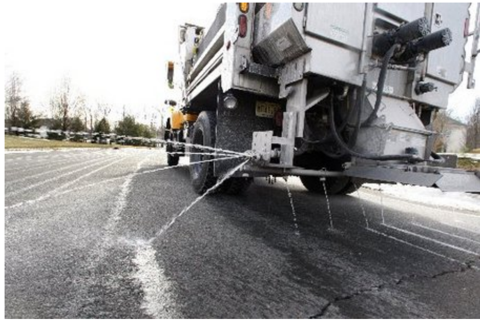
(Brine (saltwater) being applied to road surface)

Currently, both salt and sand are used on Rhode Island's roads. There are two types of mixes used on Rhode Island roads. The first type is a 1:1 mixture of salt and sand. The sand is used only to provide traction on slick surfaces, while the salt part of the mixture provides the ice and snow melting power. The other formula consists of salt only, but is applied using what is called a "closed loop spreader control system". This new technology will be discussed later in this document. Aside from the mixture types used, there are generally three methods of snow/ice road maintenance practiced and they are: