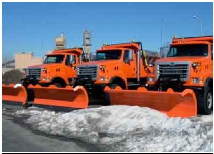
(Plow trucks, DOT)