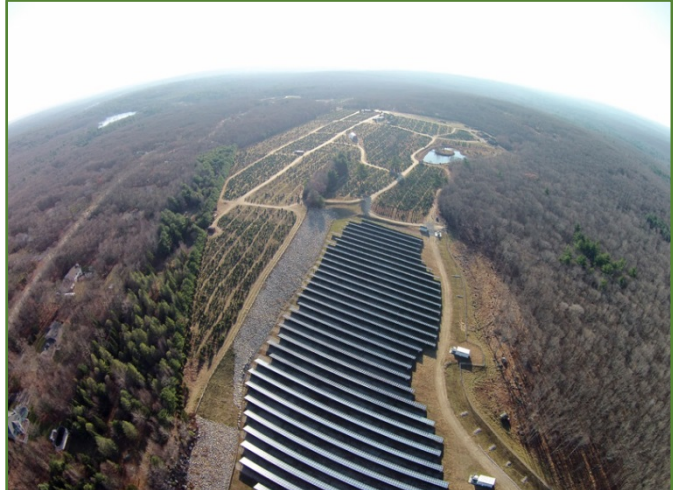
2 MW Solar System at Leyden Christmas Tree Farm, West Greenwich – Farm used 12 acres of 92 acres or 13% of the total property.

Ground mounted solar energy systems and any transmission, distribution and other related facilities should be designed to minimize any impacts to important agricultural lands. Farms supply fresh, local food, maintain the State’s rural character, and protect wildlife habitat and environmentally sensitive areas such as meadows, woodlands, wetlands and streams. Further, local agriculture reduces the amount of food that must be transported long distances and the energy consumption associated with that transport. Regenerative agricultural practices build healthy soils that store carbon in its rich organic content. Solar energy systems on farmland should be designed to minimize disruption to agricultural operations 7 .