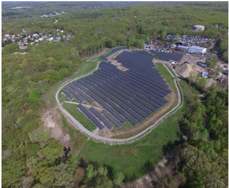
2.6 MW Solar Energy System, Closed Landfill, North Providence, RI