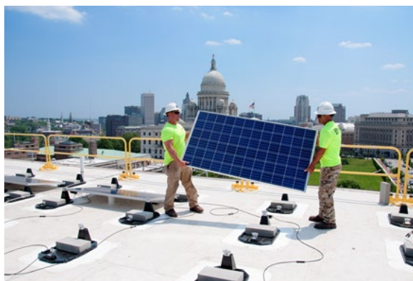
RI Department of Administration – Rooftop Solar Installation (2018)

This report focuses on the siting and design of solar photovoltaic (PV) energy generating facilities. It contains principles for renewable energy siting and recommendations to promote well-planned renewable energy development through municipal comprehensive planning and zoning. At the end of the Guide, there are resources for online mapping, geographic information (GIS), and other information, as well as a glossary of terms. The guidance provided in this document is intended to facilitate a fair balancing of interests in considering solar energy systems.