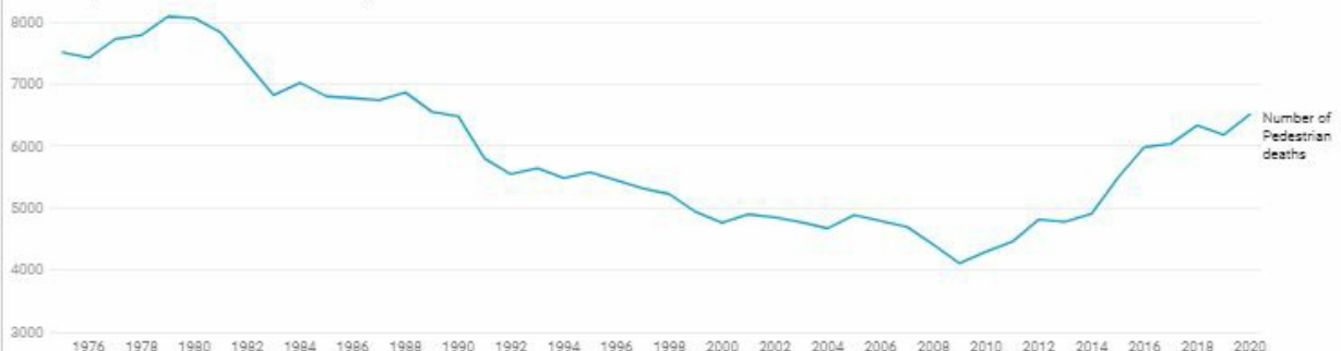
Chart: The League of American Bicyclists - Get the data - Download image - Created with Datawrapper

Number of pedestrian fatalities recorded annually from 1975 to 2020