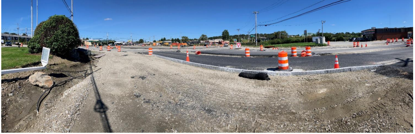
Construction on JT Connell September 19, 2021